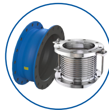
Expansion Joints: Rubber | Metal