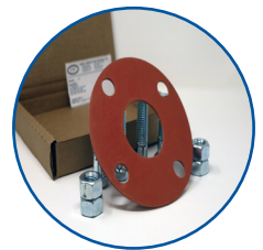
Fasteners & Kits

FDA grade and metal detectable gaskets. * FDA expanded PTFE.