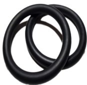
Simriz® FFKM O-Rings