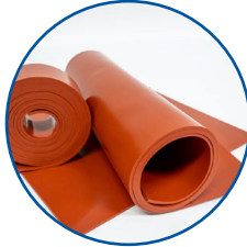
Sheet Material Elastomer