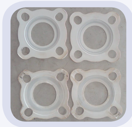
5 Year - Close Up