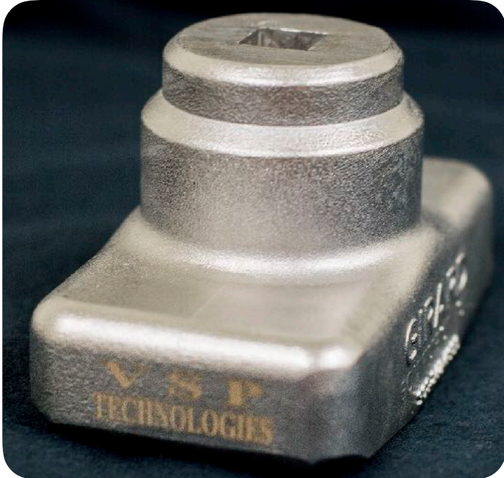
Road Tankers Part # 99998-GP19895