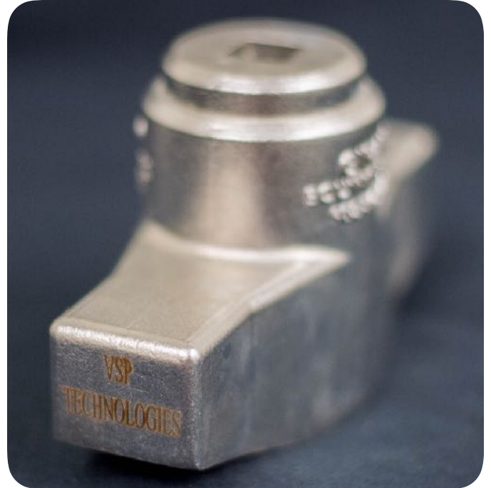
ISO Tanks Part # 99998-GP19897