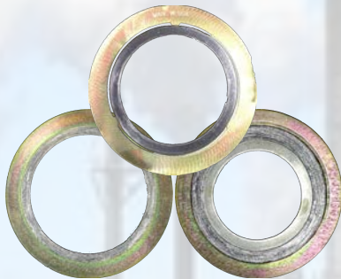
Spiral Wound Gaskets Outer, Inner & Anti-Buckling 326