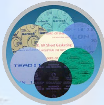
CAD Controlled Manufacturing PTFE, Fiber Gaskets, Flexible Graphite