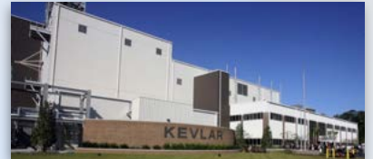
DuPont Cooper River Kevlar® Plant 2009