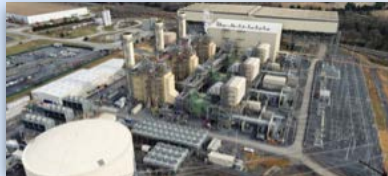
Dominion Warren County Power Station 2015