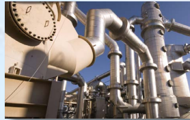
DuPont Morse Mill Acid Plant 2008