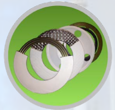
Specialty Products 14 U.S. Patents