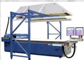
CAD Controlled Manufacturing 9-Reciprocating Knife Tables 1-Waterjet Table