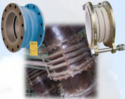
Expansion Joints Rubber, Metal, PTFE

Cut Gaskets, Spiral Wound Gaskets, Expansion Joints, Fasteners