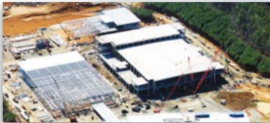
White Oak Semi-Conductor Plant Build 1996