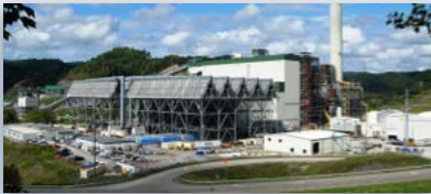
Dominion Virginia Hybrid Energy Center 2012