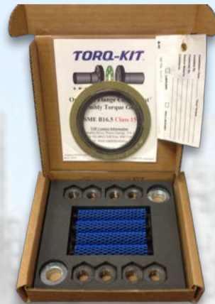
Fasteners Flange Assembly Kits Tracking Documents