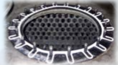
Stress Optimized Designs Tracking Documents