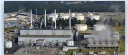
DuPont Spruance Zytel® Plant 2012 Kevlar® Plant Expansion 2002