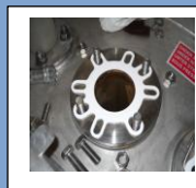
Some of VSP's Patented & Specialty Products