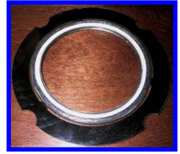
Edge ® Dual Flange

Universal chemical resistance, high tightness, purity/non-contaminating, low stress to seal and FIRE SAFE .