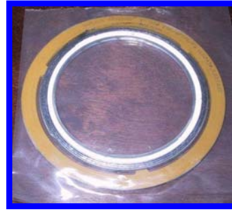
Edge ® (Oxygen Cleaned)